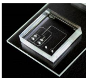
Figure 1: Pico-Gen™ biochip for picodroplet generation.