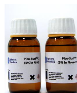
Figure 3: Novel biocompatible surfactants (Pico-Surf™) stabilise picodroplets for many days.